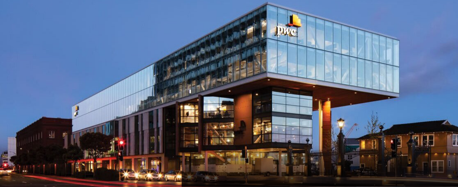
PwC Centre Wellington