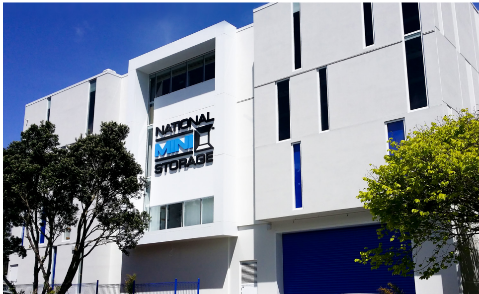
National Mini Storage Manukau Road