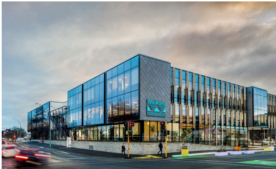
Tristram Street Precinct, Hamilton

For more information call 0800 Marley (0800 627 539) and ask for our in house designer.