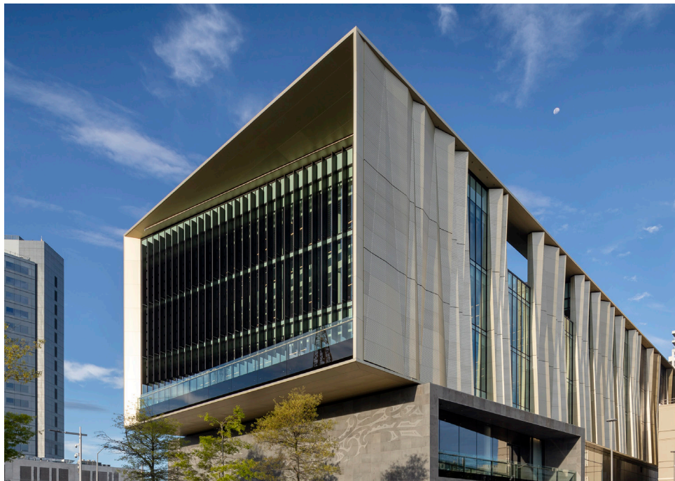
Tūranga - Christchurch Central Library